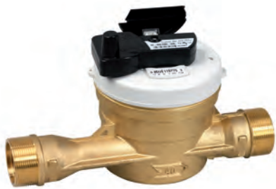
► Cyble RF fitted on Commercial and Industrial water meter