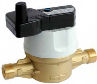
► Cyble RF fitted on Residential water meter